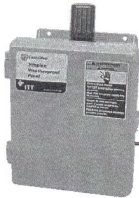
S120ENPR Environment Protector Panel